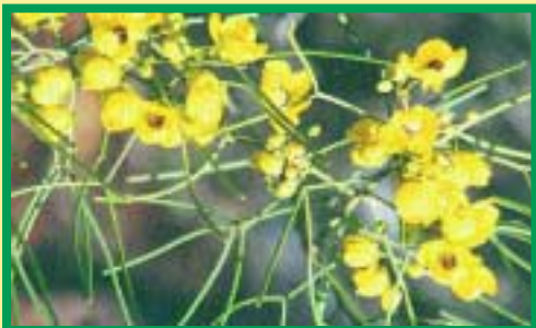
Senna artemisioides ssp. filifolia (Cassia)