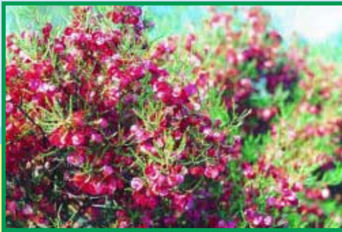
Dodonaea lobulata (Native hopbush)