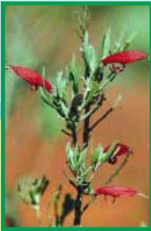
Eremophila glabra (Tar bush)

of the Eastern Goldfields contain a large variety of plants, some of which make excellent garden specimens. Some, like the Poverty Bush ( Eremophila ) have lovely flowers, some have attractive seed pods like the Senna (previously known as Cassia ): while others have interesting foliage such as the Bookleaf Mallee ( Eucalyptus kruseana ) and the Kurrajong Tree ( Brachychiton gregorii ).