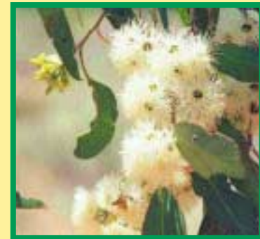
Eucalyptus lesouefii (Goldfields blackbutt)