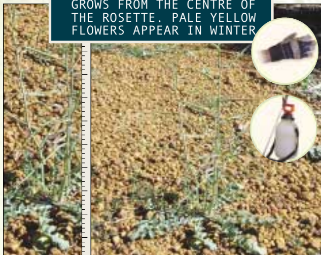
AN ANNUAL THAT FORMS A FLAT ROSETTE

( Brassica tournefortii ) AN UPRIGHT, BRANCHED STEM GROWS FROM THE CENTRE OF THE ROSETTE. PALE YELLOW FLOWERS APPEAR IN WINTER