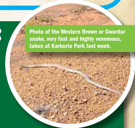
Photo of the Western Brown or Gwardar snake, very fast and highly venomous, taken at Karlkurla Park last week.

For more information please contact the City of Kalgoorlie-Boulder on 9021 9600 or visit their website on www.kalbould.wa.gov.au