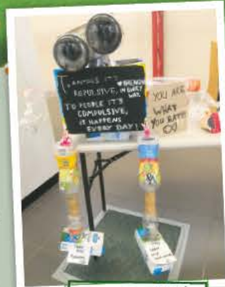
Above: Crowd Favourite and People's Choice Award Winning Entry 'Wasted Life' by St Mary's Primary School.