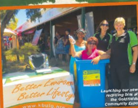
Launching our new recycling bins at the Goldfields Community Expo