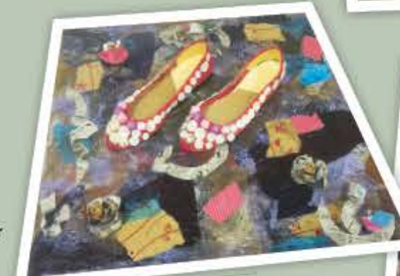
Left: Winning Entry 2D Poster/ Painting/Collage: 'Think about the eco-footprint' by Lesley Nazari.

the community's creativity and dedication to art & sustainability at this year's event in November. Start conceptualizing your entry now to provide you with plenty of time to collect the necessary recyclable materials and put them together.