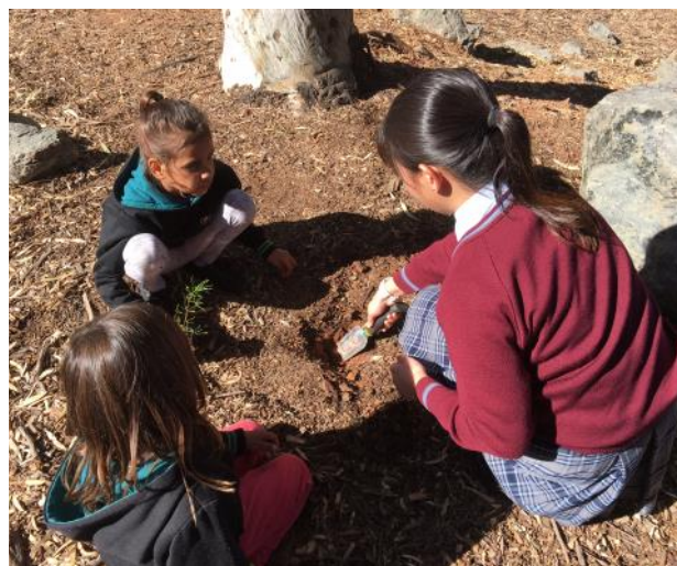
John Paul College Students assist East Kalgoorlie Primary School Students with planting trees

Over the last year KBULG received exceptionally positive feedback from participating schools in regards to the group's ongoing commitment to Junior Landcare education. The program encourages the young generation to gain an appreciation of the unique biodiversity values of the region, and to actively consider the implications of urban and industrial developments. KBULG is grateful to Northern Star Resources who continue to provide funding and on-ground support to the program.